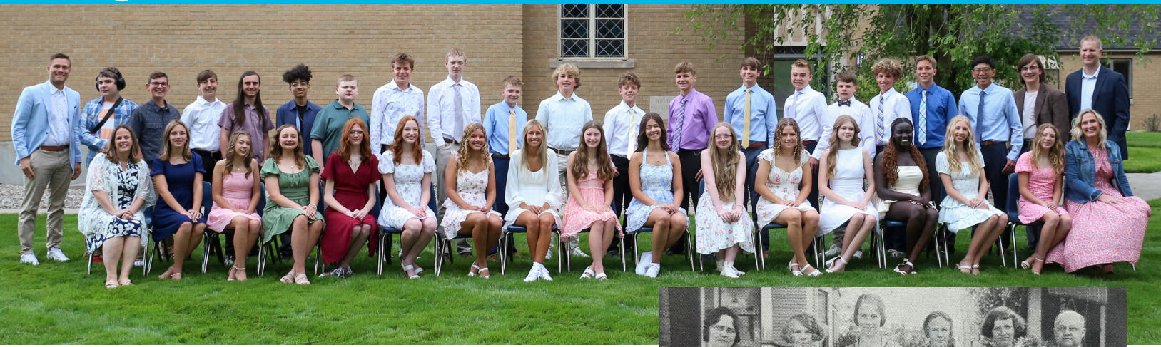
Graduating Class of 2025