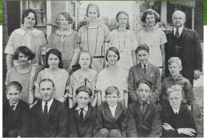
Graduating Class of 1925

Graduation is always bittersweet, and this year is no different, as we wish our 35 eighth grade graduates well in their next endeavors. For more than 140 years, West Side Christian School graduates have gone out with minds and hearts developed to serve and glorify Jesus Christ. This year's class is no exception. Congratulations on a job well done!